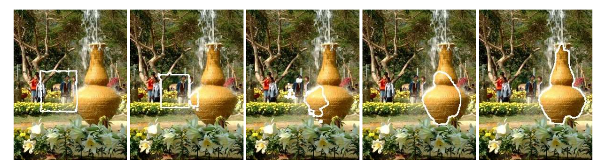
Figure 2. Convergent results obtained for poor initial conditions using proposed model.

for the currently defined foreground pixels \mathfrak{f} , and (b) the background PDF p(I_{\mathbf{x}}|\mathfrak{b}) and the model PDF for the currently defined background pixels \mathfrak{b} , and the third imposes smoothness throughout the image space by minimizing the foreground labeling gradient magnitude.